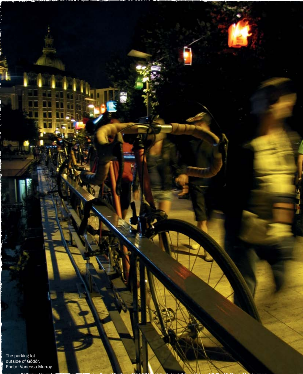
The parking lot outside of Gödör.

Downtown Budapest is the perfect place to start the evening’s festivities. It’s relatively small with a vibe that swings from modern to kitsch, and cosy village to grand metropolis. If you’re here in summer, make the most of the late evening sunshine at venues like Gödör, a relaxed outdoor cafe, nightclub and art space set below street level. Gödör has an outdoor stage offering free concerts and an ancient amphitheatre feel. Whatever the weather, it’s the perfect place to ease yourself into a long night ahead. They also rent bikes for free so if you’re planning on covering a bit of ground, you could consider hiring one. But be warned: Buda is no Amsterdam. The lack of bike lanes, cobblestoned streets and left-hand driving make cycling here a bit of an adventure. Thankfully, there are also public buses, trams, trolleys, taxis and an underground metro service – Europe’s first. The beer’s pretty good, too. Gödör Erzsébet Square, District V, Pest www.godorklub.hu