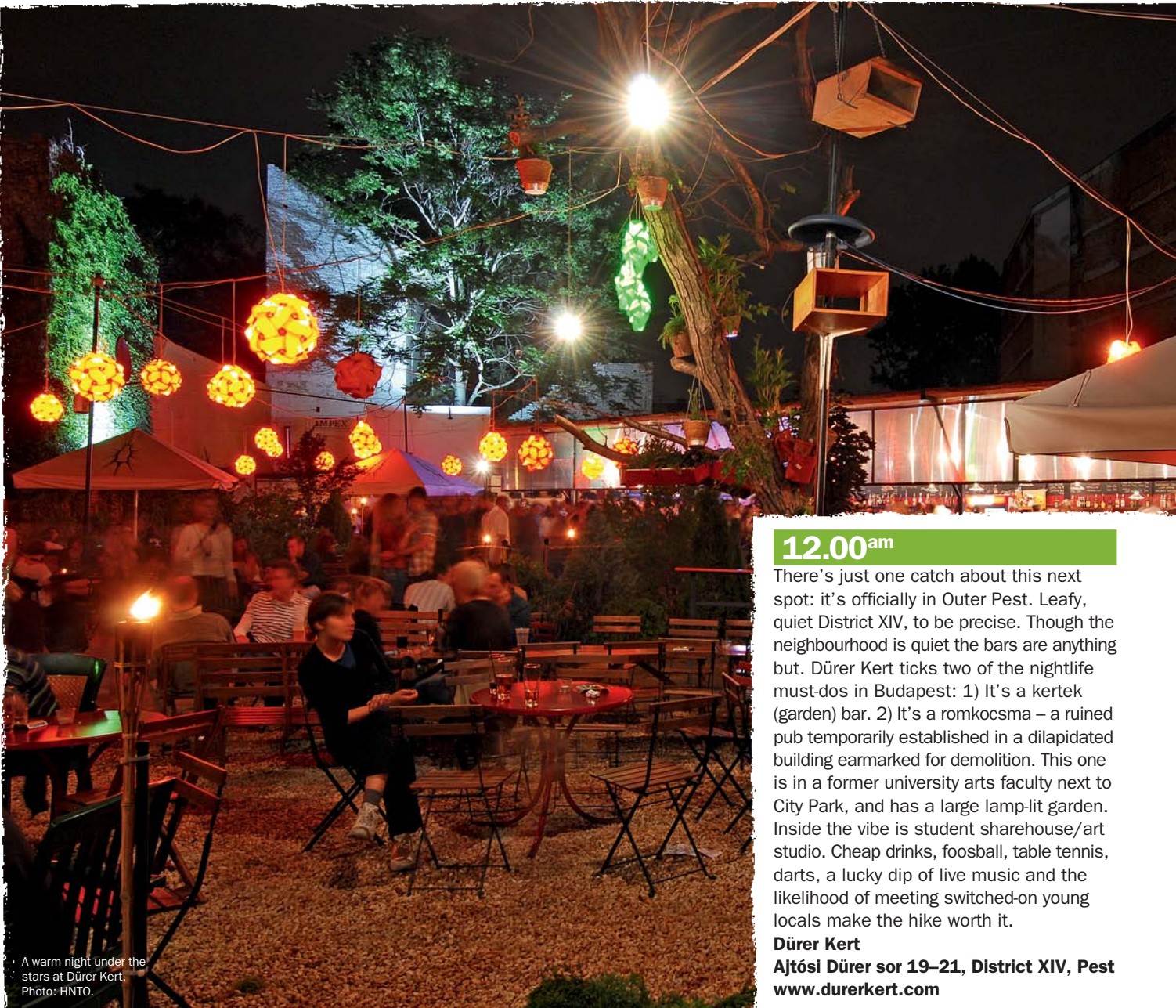
A warm night under the stars at Dürer Kert. Photo: HNTO.

Head across the river to A38: a decommissioned 1968 Ukrainian stone-hauling barge. It’s now a floating restaurant and terrace bar by day and kick-arse club by night. Think jazz, blues, electronic, hip-hop, reggae and even classical. There are more than 20 types of the native plonk on offer – a potent fruit brandy called pálinka that’s got an alcohol content of 37–86 per cent. Knock a couple back before moving onto better-known evils like beer. Or try the bar’s own flaming cocktail creation, ‘Massive Attack’. It’s enough to, er, sink a ship. A38 Just south of Petöfi Bridge, District I, Buda www.a38.hu