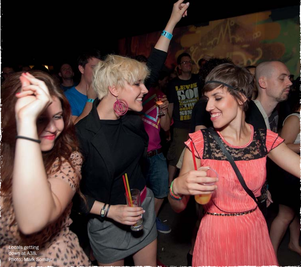
Locals getting down at A38.

Head across the river to A38: a decommissioned 1968 Ukrainian stone-hauling barge. It’s now a floating restaurant and terrace bar by day and kick-arse club by night. Think jazz, blues, electronic, hip-hop, reggae and even classical. There are more than 20 types of the native plonk on offer – a potent fruit brandy called pálinka that’s got an alcohol content of 37–86 per cent. Knock a couple back before moving onto better-known evils like beer. Or try the bar’s own flaming cocktail creation, ‘Massive Attack’. It’s enough to, er, sink a ship. A38 Just south of Petöfi Bridge, District I, Buda www.a38.hu