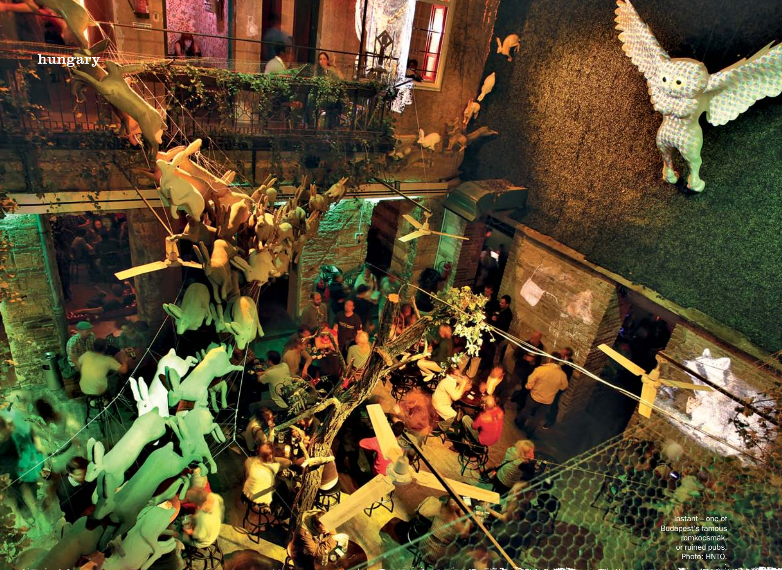
Instant – one of Budapest's famous romkocsma, or ruined pubs.